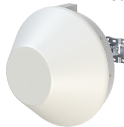
35cm size w/ 60GHz + 5GHz